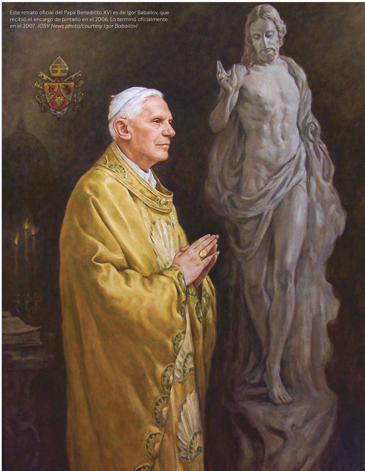
Este retrato oficial del Papa Benedicto XVI es de Igor Babailov, que recibió el encargo de pintarlo en el 2006. Lo terminó oficialmente en el 2007.