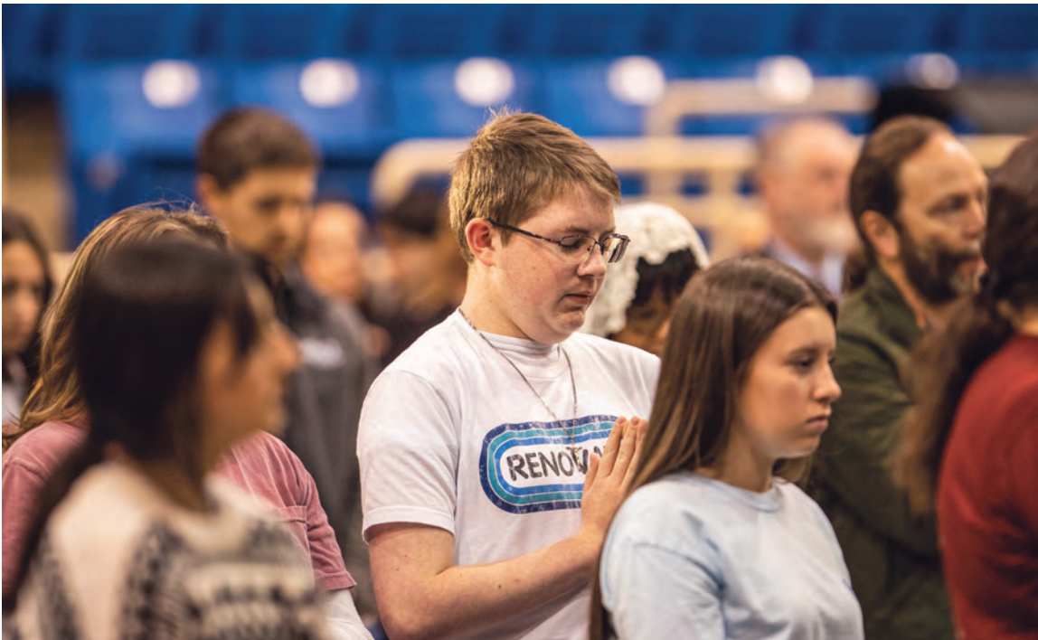
Young worshippers pray during the Respect Life Mass Jan. 22 at Nolan Catholic High School. The event drew more than 350 Catholics from across the Diocese of Fort Worth.