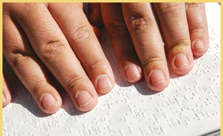
Xavier Society for the Blind provides resources to visually impaired Catholics.

For more than 120 years, the New York-based nonprofit has provided free Mass propers (liturgical texts that change daily), faith-based books, and religious publications in braille and other technologies to 700