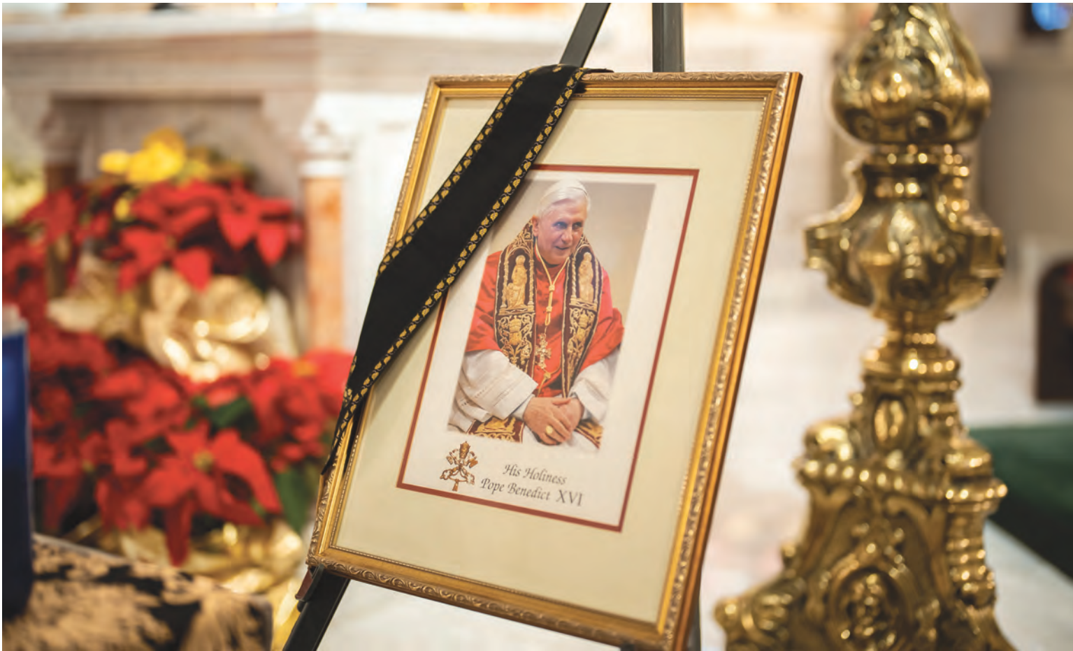
Un retrato del difunto Papa Benedicto XVI en la Catedral de San Patricio durante una Misa por el descanso de su alma el 8 de enero de 2023.