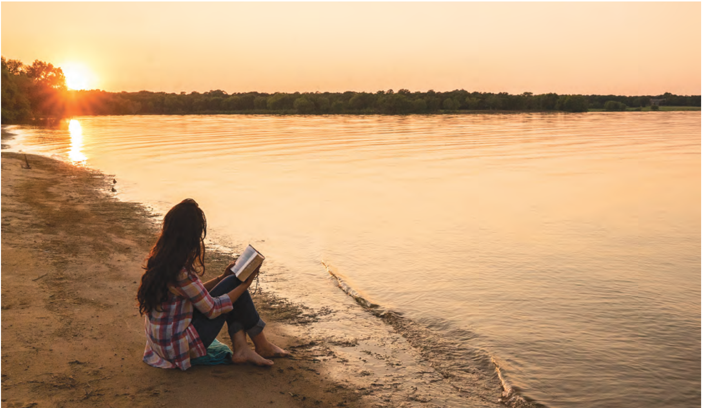
Una joven lee la Liturgia de las Horas en Montserrat Jesuit Retreat House en Lake Dallas.