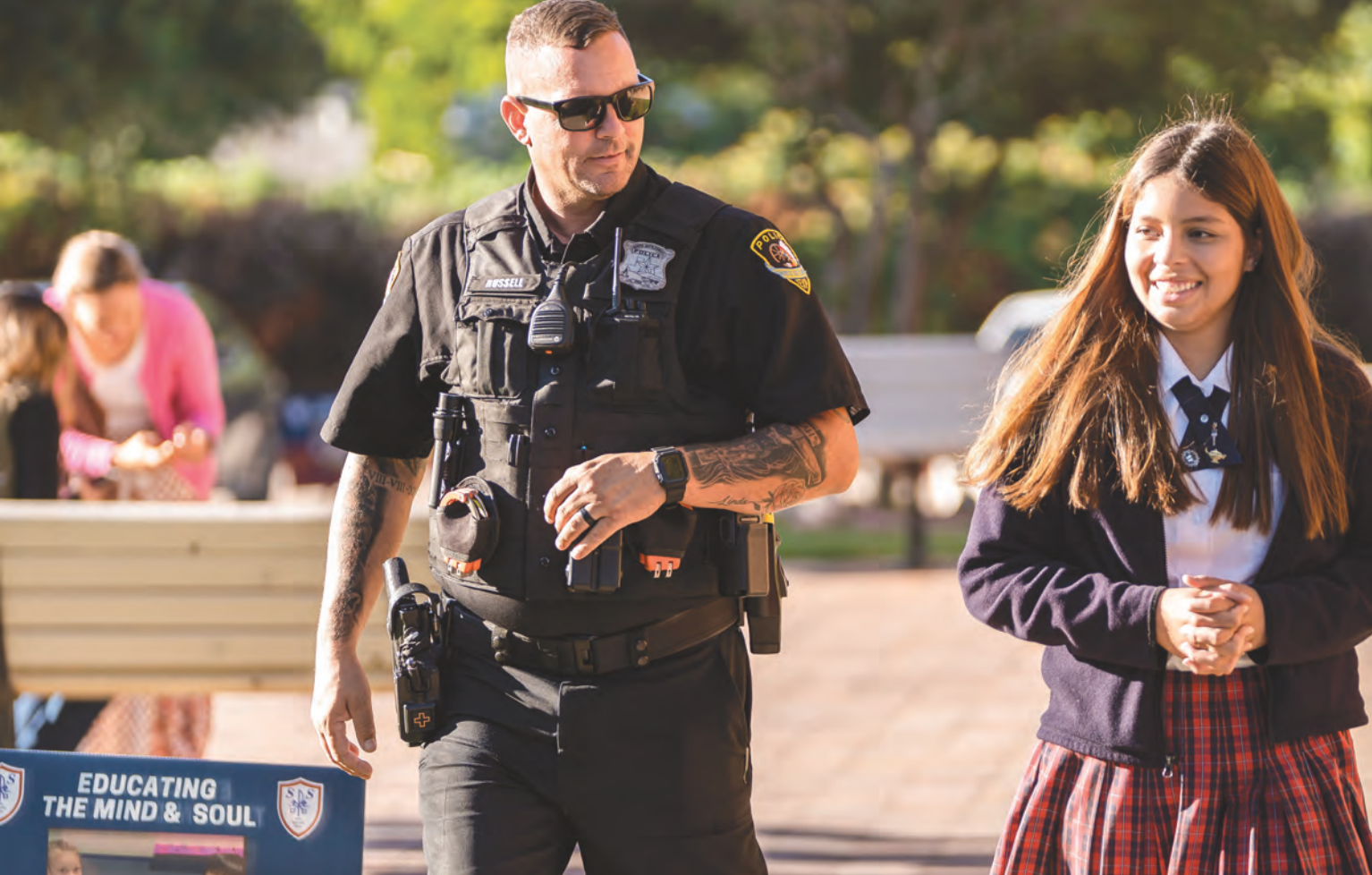
Un oficial de la policía vigila mientras los estudiantes de la Escuela de St. Peter the Apostle pasan en fila.

escuelas secundarias públicas por muchos años y actualmente se ven a menudo en los planteles escolares de la primaria e intermedia, y se financian con los impuestos pagados por los contribuyentes. Sin embargo, las escuelas privadas deben aportar sus propios fondos.