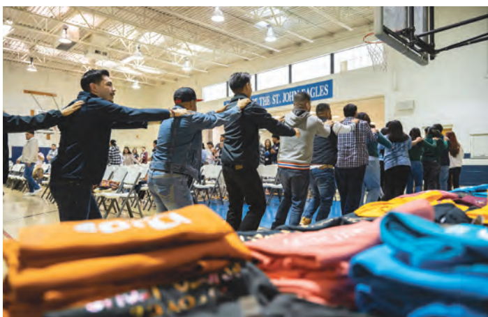
Jóvenes adultos se unen a una danza tradicional mexicana durante el retiro.