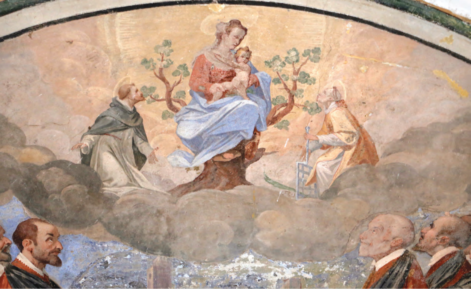
Santa Maria della Quercia, Nuestra Señora del roble.