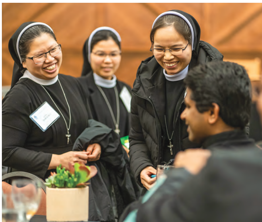
Sisters from the Lovers of the Holy Cross laugh with clergy.

Diocese celebrates World Day for Consecrated Life