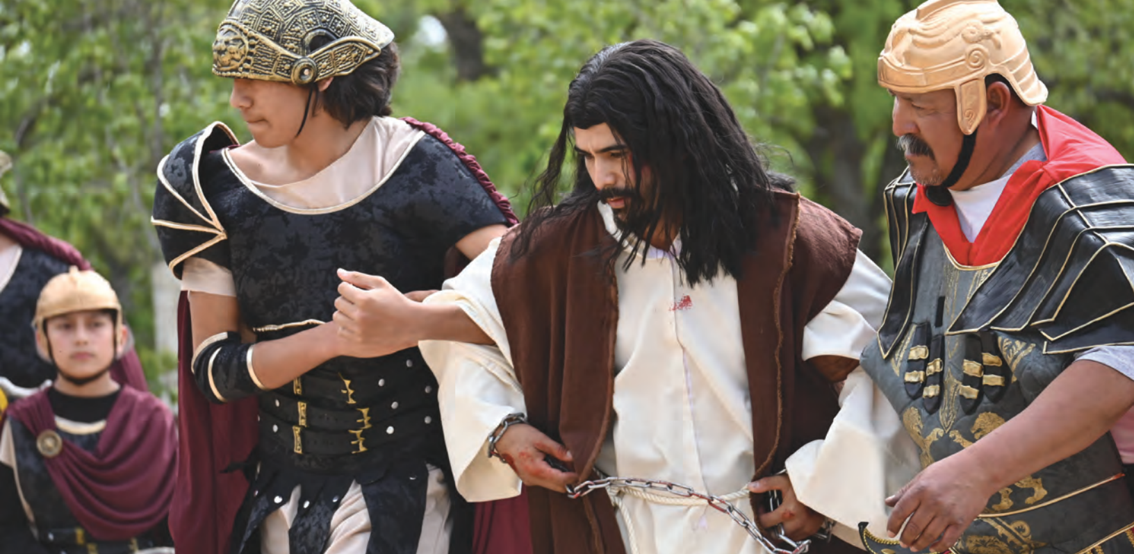
La obra de la Pasión de Jesús en Eastland presentada en el 2023.