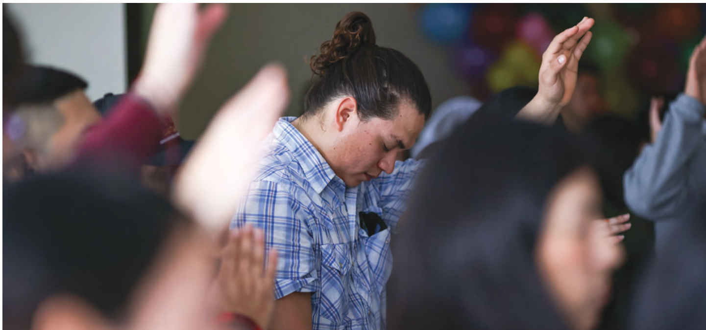
Los participantes del Retiro de Año Nuevo oran el 27 de enero en la Parroquia de St. Mary of the Assumption en Fort Worth.