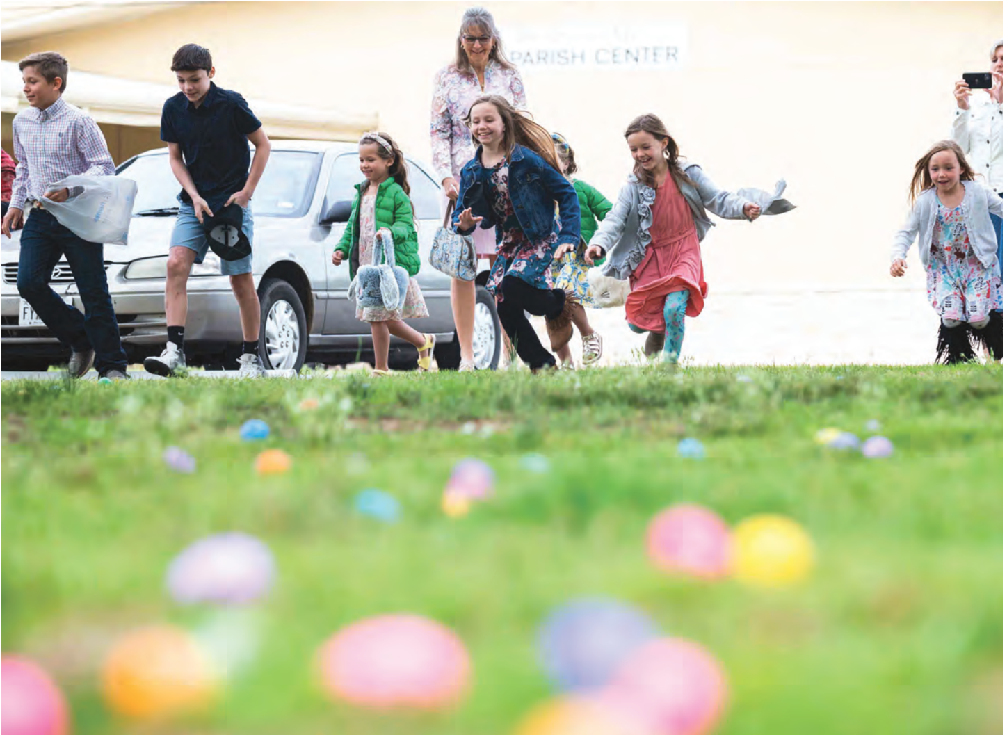
Children scramble to find eggs after celebrating Easter Sunday Mass at St. Thomas Aquinas Parish in Pilot Point on April 9, 2023.