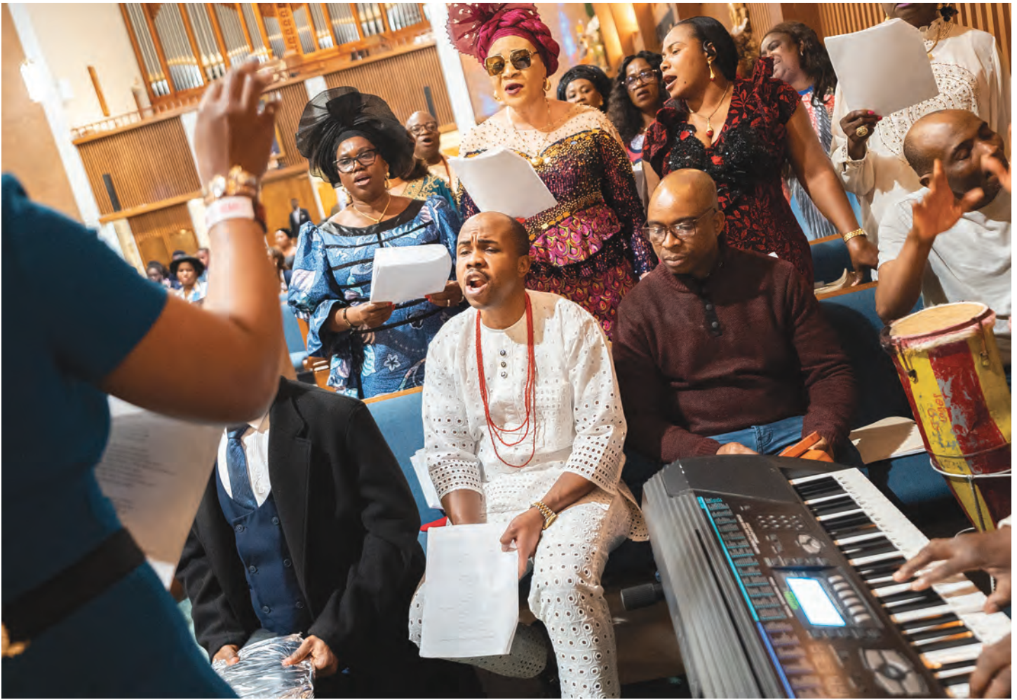
The choir at the Igbo Nigerian Mass sings during the Mass on Jan. 28 at St. Maria Goretti Parish in Arlington.

us here. They are so happy, and they're enjoying it, and they can hear the priest, the sermons, the liturgy — everything."