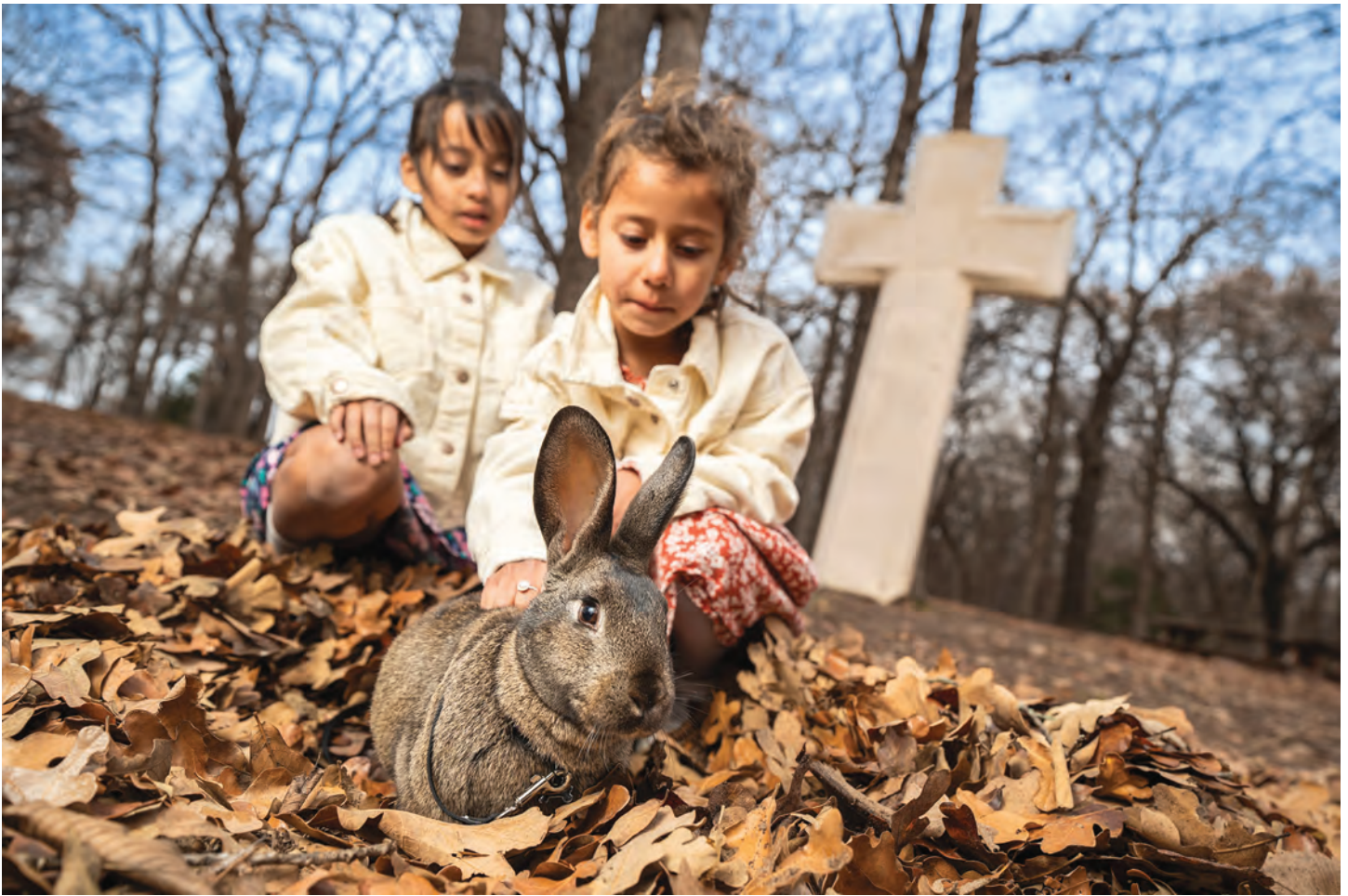
Bunnies are among the many symbols of new life seen around Easter.

Lilies also represent purity, which is why saints who die as virgin martyrs are often pictured holding the flower.