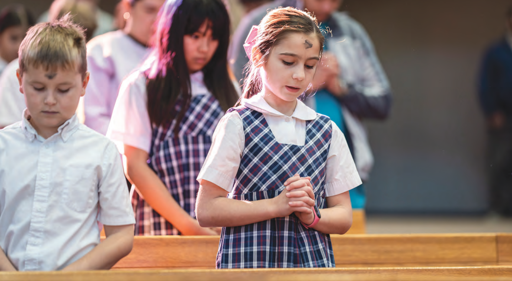
Students from St. Joseph Catholic School pray during Ash Wednesday Mass on Feb. 14 at St. Joseph Parish in Arlington.

Wednesday and Lent through repetition. Every day, her classroom participates in one Lent-focused activity and a nightly homework assignment.