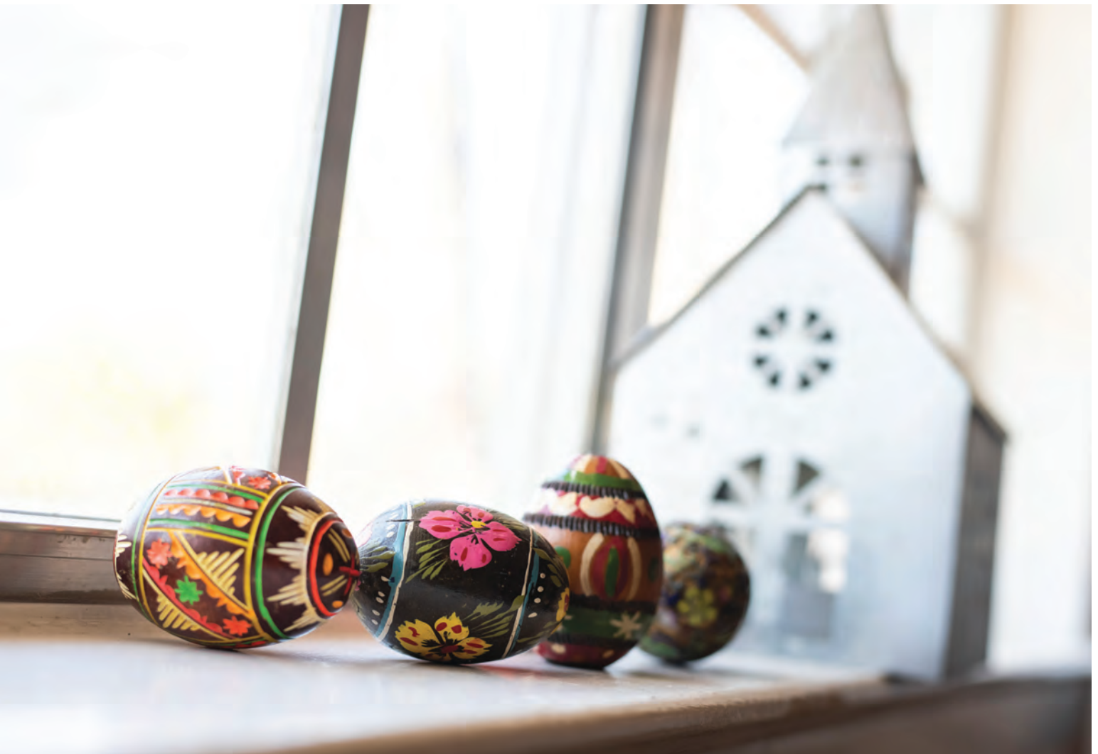
Ornately painted eggs are an Easter tradition in many cultures and families.

in Poland, pisanki . Techniques and styles differ from region to region.