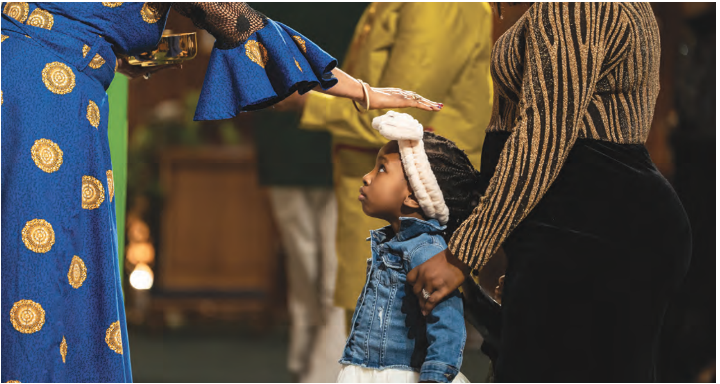
An extraordinary minister of holy Communion blesses a child at the Igbo Mass on Jan. 28 at St. Maria Goretti Parish in Arlington.