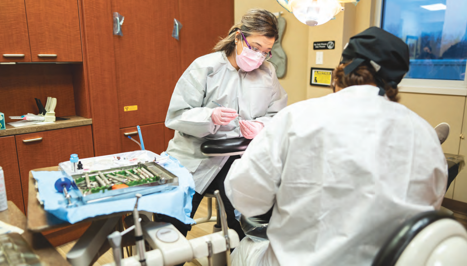
Foto de arriba: Un higienista dental de la Clínica Dental de CCFW brinda atención a un cliente el 24 de enero.