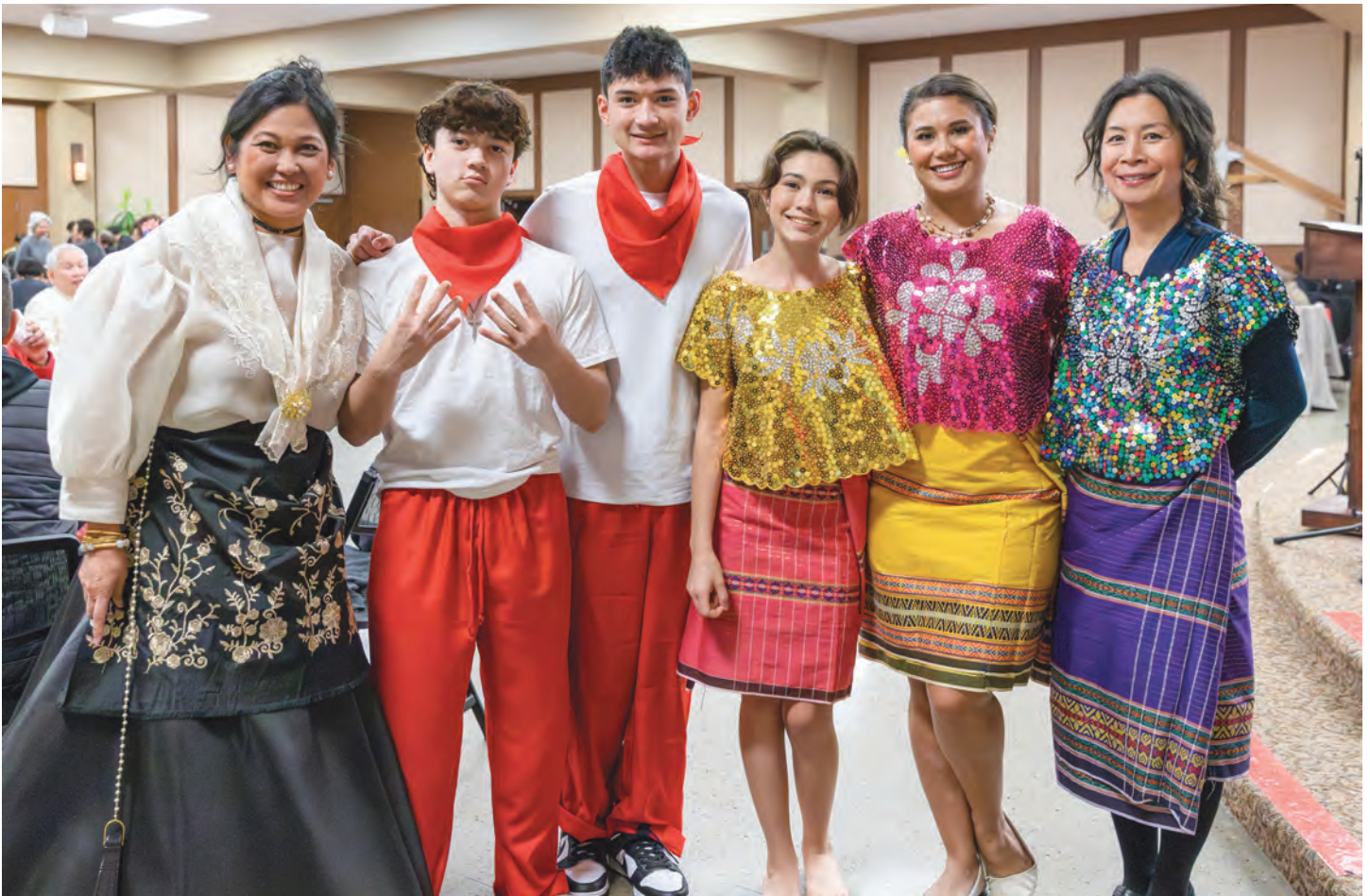
An array of Filipino dancers pose at the Señor Santo Niño Feast Day festival held at St. Michael Parish in Bedford on Jan. 20.