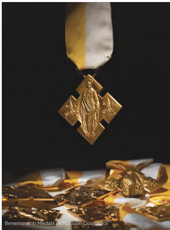
Benemerenti Medals