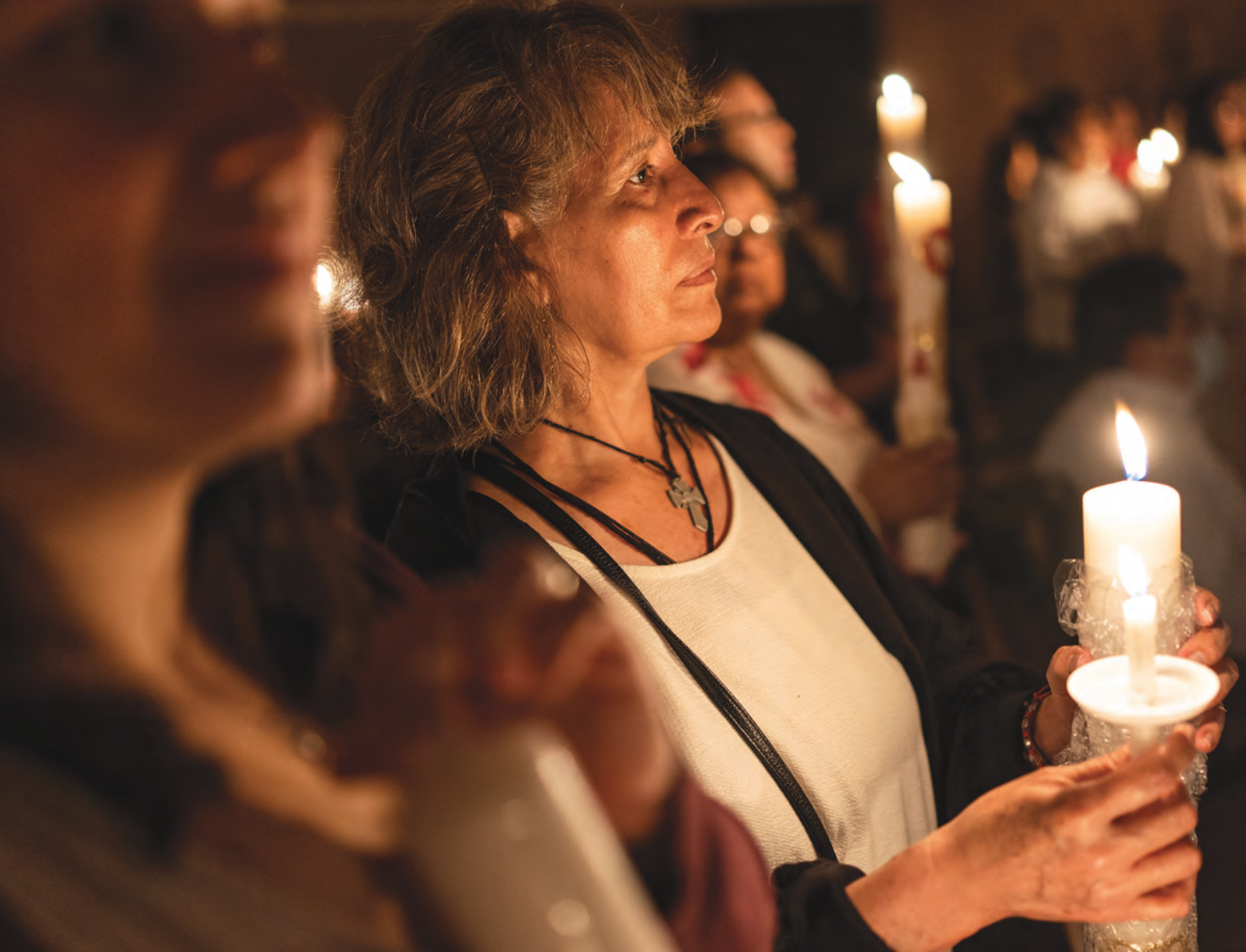
Una feligrés sostiene dos velas al celebrarse la ceremonia de la luz durante la Vigilia Pascual en la Parroquia de St. Peter the Apostle en Fort Worth el 16 de Abril de 2022.

durante la Vigilia Pascual, la cual tiene lugar la noche del Sábado de Gloria, la Iglesia vigila y celebra la Resurrección de Cristo. Se utilizan muchos símbolos, pero hay uno de ellos que se destaca: el Cirio Pascual. “El Cirio Pascual es una vela blanca de cera en la cual están grabadas las letras griegas Alfa y Omega, que significan que Dios es el principio y el fin. El Cirio Pascual lleva grabado también los numerales del año en curso. El fuego del Cirio Pascual es fuego que renueva la fe y representa la luz de Cristo resucitado y vencedor de las sombras y las tinieblas”, afirma el Diácono Vera.